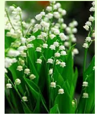
Lily of The Valley

Welcome to our new guests and welcome back to our Seasonal guests! We hope you've had a wonderful stay with us this opening month. In May we have a new event coming up called Dining on the Deck & May is for Mexican cuisine! Guests will be shown how to cook a yummy meal on the grill. This event will be $20 a person, all guests are welcome however space is limited and reservations are required! So reserve now and join us on May 14th under the pavilion!